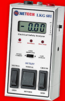
LKG 601 Electrical Safety Tester