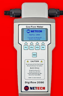
DIGIFLOW 2000 Digital Gas Flow Meter