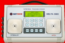
DELTA 3300 Defibrillator Analyzer