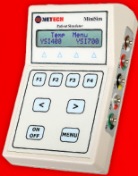
MINISIM 1000 Patient Simulator