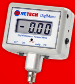
DIGIMANO 1000 Pressure Vacuum Meter