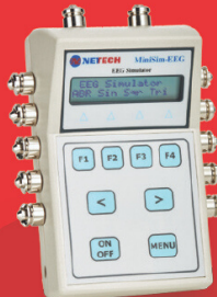
MINISIM EEG EEG Simulator