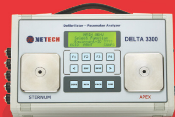
DELTA 3300 Defibrillator Tester