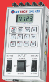
LKG 610 Electrical Safety Tester