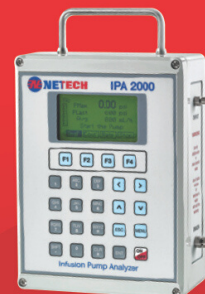
IPA 2000 Infusion Pump Tester