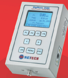
DIGIMANO 2500 Pressure Meter