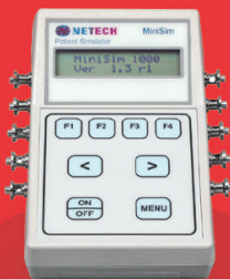
MINISIM 1000 Patient Simulator